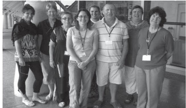
Above left: Biennial Job Delegates Conference group photo